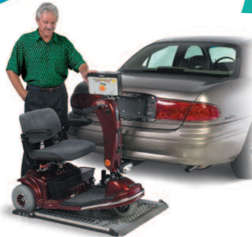
Model AL100 Shown

Harmar's lifts and ramps are designed and built with the "Harmar difference" - they are simpler, stronger, lighter and easier to use.